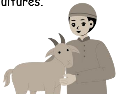
Eid Al Adha

The Islamic or Muslim market is one of the most important markets for goats and especially sheep. There are between 5 and 8 million Muslims in the US, most concentrated in urban areas. The population is growing fast, both from immigration and through conversions. Muslims should not be stereotyped. The population is diverse, and it represents many different races, nationalities, and cultures.