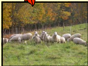
Equal access programs